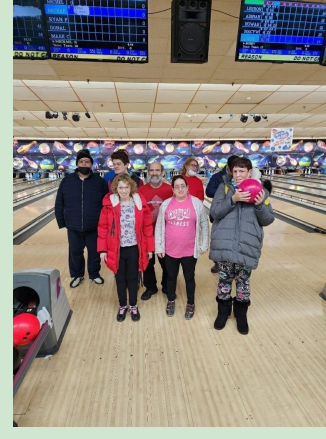
ABOVE: (Left) Clients attended the show "Hercules" at Paper Mill Playhouse in Millburn. An visit to the Liberty Science Center (center) in Jersey City was educational and informative. (Right) A night of bowling was an awesome group activity.