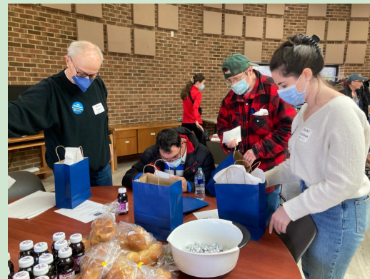
ABOVE: (Clockwise - starting left) Volunteers from Jewish Federation of Greater MetroWest NJ recently visited JESPY on several occasions. They made and filled colorful Purim bags with JESPY clients that were donated to seniors. During other visits, Federation volunteers created Purim crafts with clients and made Shabbat kits - in blue bags - during a CommUnity Mitzvah event.

In addition, members of the Fed Women's Philanthropy group (a leadership development group that is part of Jewish Federation of Greater MetroWest) enjoyed the opportunity to tie dye with JESPY Day Program clients.