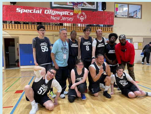
Photo left: Lots of medal wins at Special Olympics Tennis State Sectionals, held at Passaic County Technical Institute in Wayne. Lots of team spirit and a Bronze Medal win for the JESPY basketball team (shown right) at the Special Olympics Basketball Championship in Wildwood.