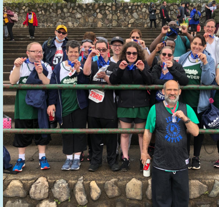
Participants on the JESPY Thunder Track & Field team took home lots of medals from the Area 9 Special Olympics Games held at Brookdale Park in Essex county.